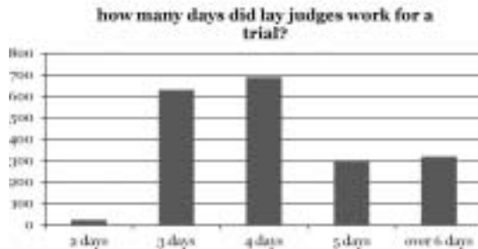
【Table 2】 total; 1,949 cases, average; 4.4 days